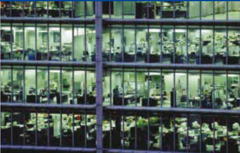
Business parks, Banks, Multi-storey office premises.