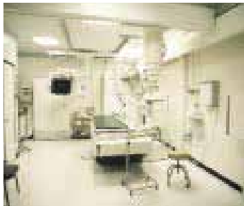
Hospitals, prisons, schools, colleges, universities